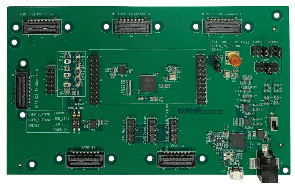
Figure 2 Trion T20 MIPI Development Board

The Trion T20 MIPI development board features: